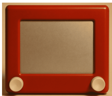
Etch a Sketch