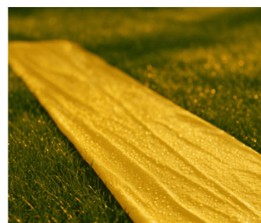
Slip N Slide