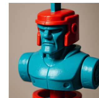
Rock 'em Sock 'em Robots