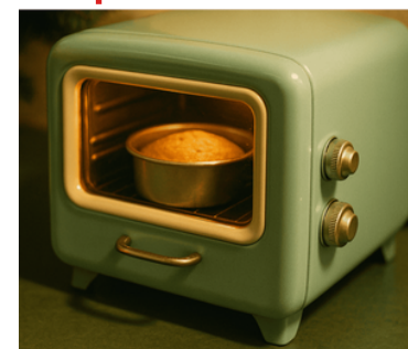
Easy Bake Oven